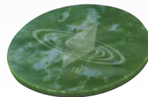
Green Marble 3.5"