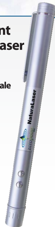
6" Silver Laser