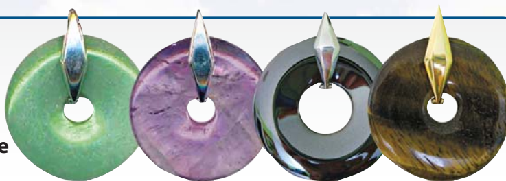
Green Aventurine Amethyst Hematite Tigers Eye